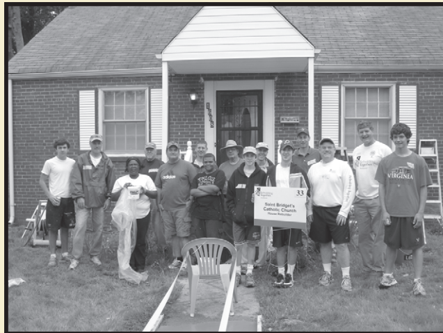
The St. Bridget Rebuilding Together Team, 2010

A big “Thank You” goes out to all of the parishioners who volunteered for the Rebuilding Together Project in 2010. Rebuilding Together is a nationwide program in which volunteer organizations repair and maintain houses owned by elderly or disabled persons in need. The project day last year was on Saturday, April 24, 2010. Approximately 50 homes in the Richmond area were included in the Rebuilding Together program. St. Bridget Church participated in the program for the 8 th consecutive year. We repaired a sidewalk and a ceiling; caulked and painted all exterior windows; painted the front porch; and constructed a handrail. Our homeowner also received a new water heater. The homeowner had been very ill, and was incredibly grateful for our assistance. A special debt of gratitude to Phil Baxa, who was our house captain for the past several years. Phil passed away suddenly just before Thanksgiving last year. This year’s project will be in Phil’s memory as we will once again sponsor a house on April 30 th . If you would like to volunteer contact Paul Amrhein at 525-7902 or paul@saintbridgetchurch.org .